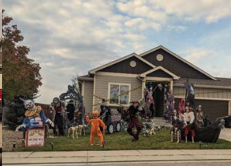
10608 Mount Evans