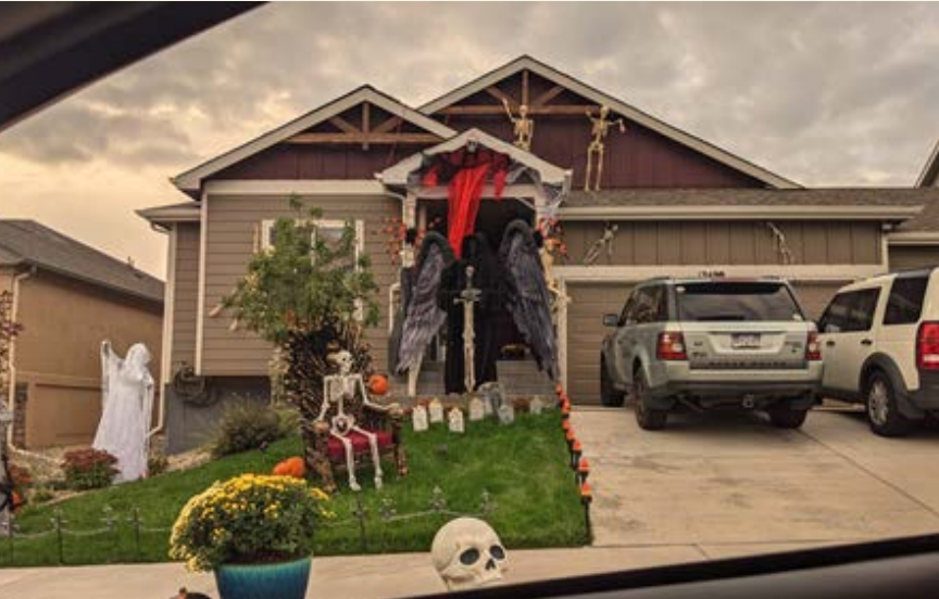
13485 Park Meadows