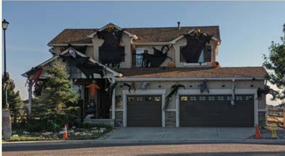
12372 Point Reyes