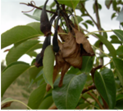
Fire Blight In Meridian Ranch

Residents in Meridian Ranch have experienced issues with trees in the past few years due to weather and this year there is an additional threat, fire blight. Fire blight is caused by a bacterium, Erwinia amylovora , and affects both trees and shrubs and gets its name from the burnt appearance of the leaves, blossoms, and branches of affected plants. If your plant becomes infected you will first notice a light tan to reddish ooze on the affected plant, which will darken after the exposure to air. This infection will move into twigs and branches from affected blossoms. You will notice the blossoms and ends of twigs shriveling and blackening.