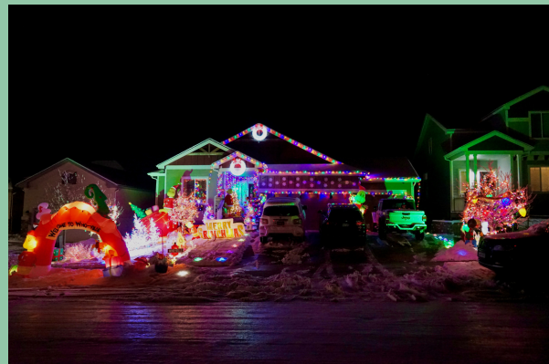
13485 Park Meadows - DRC 2 Winner

Winter is upon us, so remember the trees and shrubs, as they are thirsty! Winter watering was showcased as an article in the November newsletter by the Metro District Manager. The DRC is also reminding residents to water when the temperature maintains at 40 degrees and above. The watering will help the shrubs and trees to survive the dry winters.