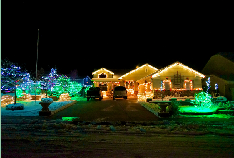
10204 Ross Lake - Grand Prize Winner

Twas the night before the new year! As we start 2024 off with a bang, let's remember our beautiful homes which were decorated so nicely for the holiday season! Congratulations!