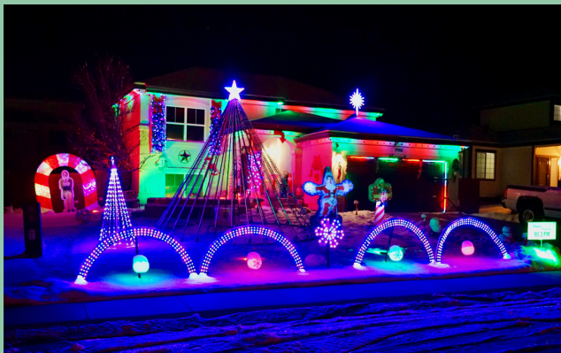
9988 Everglades - DRC 1 Winner