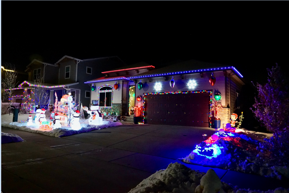
10125 Golf Crest - 1st Place Winner

Congratulations to the Christmas light winners in 2023! We appreciate everyone decorating and bringing in the spirit of the holidays!