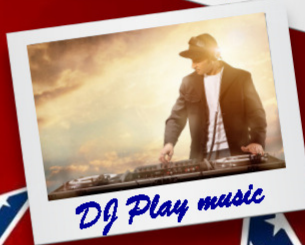
DJ Play music