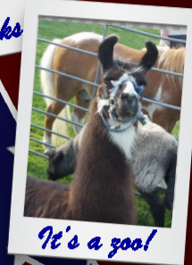
It's a zoo!