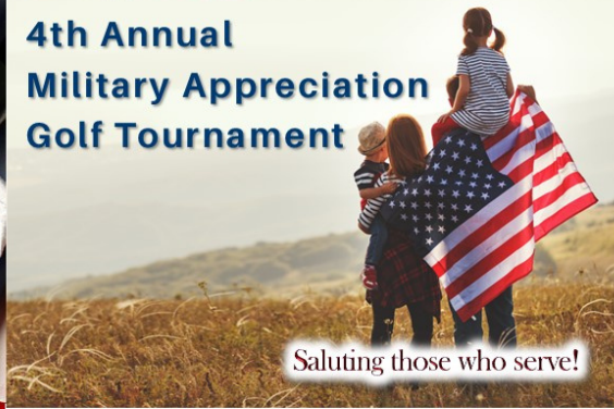
Saluting those who serve!

Sunday, September 11th, 2022 4-Person Scramble format Shotgun start at 8am.