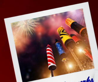
So many fireworks